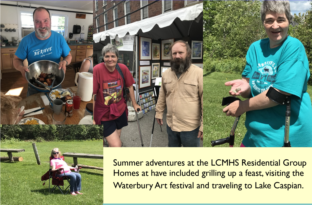
Summer adventures at the LCMHS Residential Group Homes at have included grilling up a feast, visiting the Waterbury Art festival and traveling to Lake Caspian.