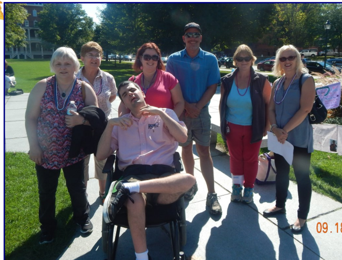
LCMHS staff and consumers at Direct Service Professionals Day