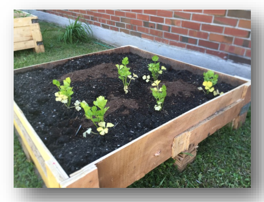
Things are already growing!